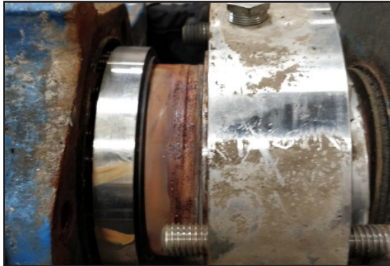
Split case pump with solid mechanical seal.

Seal change outs are now done in a matter of hours, not weeks. Reliability has improved with up to two years runtime. No seal failures reported since this conversion.